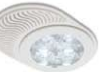
Vent Unit with OptiView® Diffuser