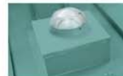
Curb Mounted Cap*

Special metal roof installation kit available upon request. *Available in 290 DS.